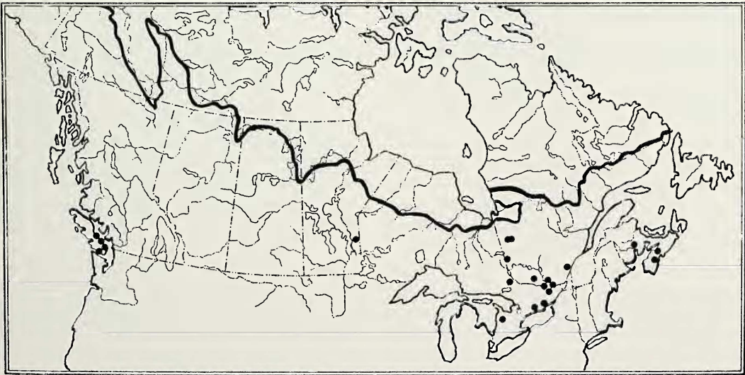
Figure 2.—Distribution of Argyrodes fictilium in Canada. The solid line shows the northern limit of the boreal forest.

The second hypothesis states that the distribution of A. fictilium may also include the boreal region, which is delimited by the north-